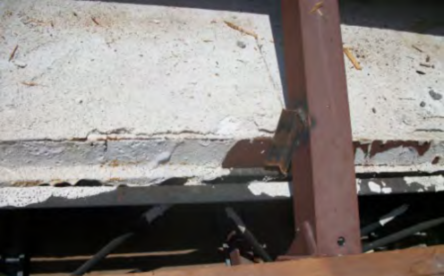
QUESTION 3, POURED GYPSUM DECK